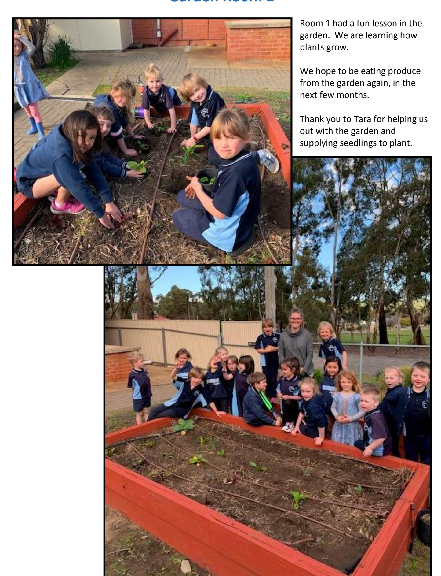
At Kersbrook Primary School we value Respect, Responsibility, Confidence and Resilience